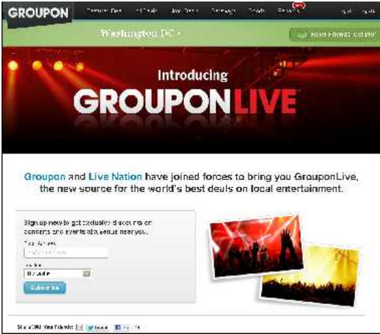
6" GrouponLive - "

μ , μ . , μ , μ , μ . , μ μ μ : μ μ μ , μ , μ , μ μ μ Groupon μ Groupon 50% μ μ μ Groupon SelfService, Groupon, μ , GrouponRewards GrouponLive. Self-Service μ μ self-service μ μ μ μ μ μ μ μ Groupon μ , Twitter (Axon, 2010). μ μ