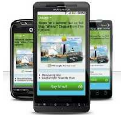
4" Android" Groupon

Facebook, Twitter, Instagram, YouTube, LinkedIn, Grouponblogs (Groupon, 2012a). Groupon